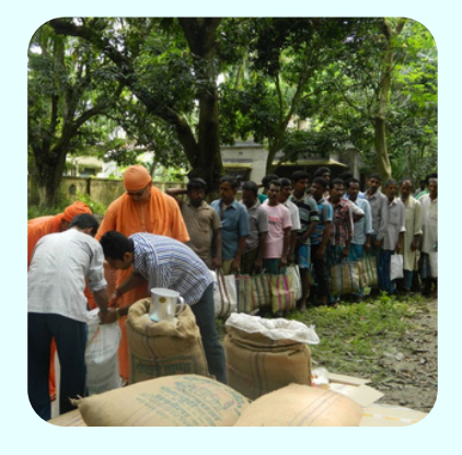
Flood Relief at Charigram