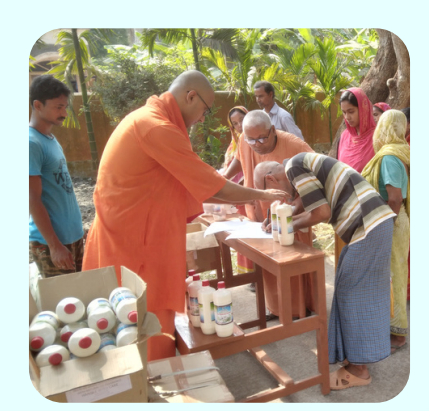
Health and hygeine