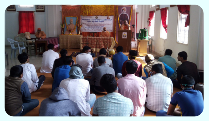
National Youth day