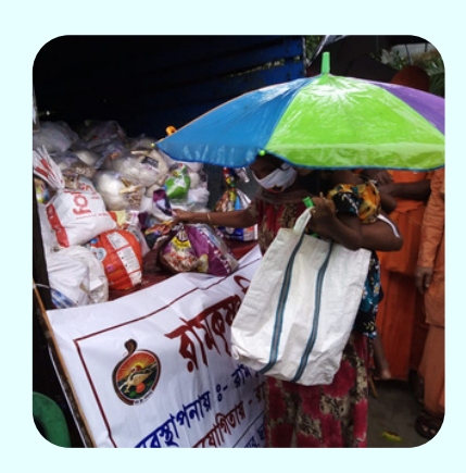
Yaas Cyclone Relief at Sundarban