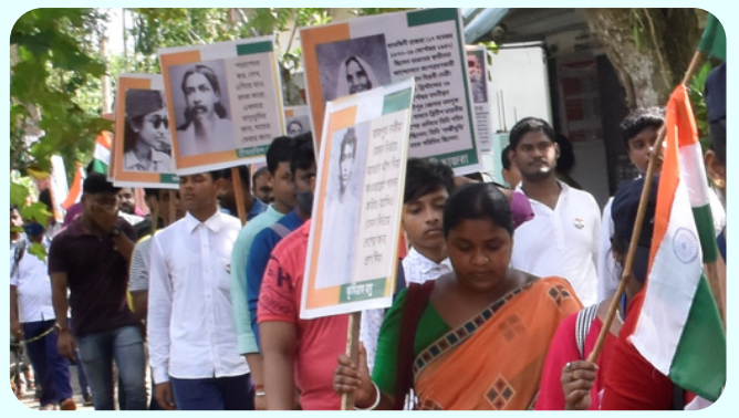
Azadi Ka Amrit Mahotsav

Classes are regularly held to empower young students to lead moral and fulfilling lives. These sessions aim to help them understand the significance of the mind and its functioning. Additionally, two major events, the National Youth Day on January 12th and Chicago Day on September 11th, are celebrated annually with youth conferences. Furthermore, there are teacher meetings and general awareness camps organized to promote awareness among youth and students.